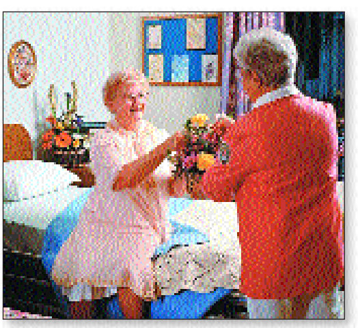
Giving and serving are simply putting God's love into practice.

God calls His people from all walks of life. No matter the nature or extent of our past sins, God forgives us when we repent and forsake them. To please God, however, we must continue to