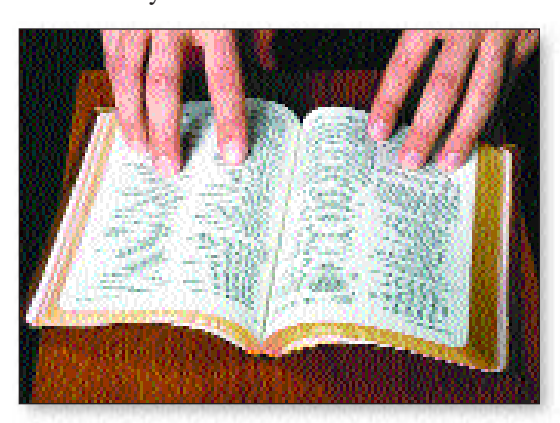
Through the Bible, God provides us with both doctrine and instruction in His way of life.

"And let us consider one another in order to stir up love and