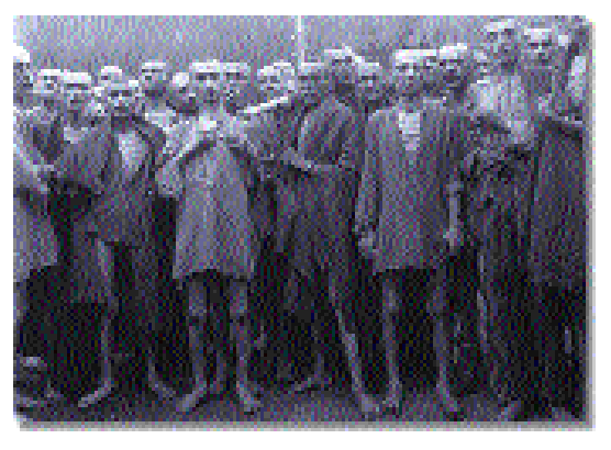
According to this prophecy, war, violence, starvation and disease may take hundreds of millions of lives.

The blast of the seventh trumpet announces the triumphant return of Jesus Christ to earth. "The kingdoms of this world" come under