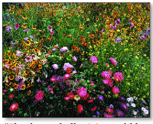
"The desert shall rejoice and blossom as the rose; it shall blossom and the dry land abundantly and rejoice, even with joy and singing."

"I will open rivers in desolate heights, and fountains in the midst of the valleys; I will make the wilderness a pool of water, springs of water. I will plant in the wilderness