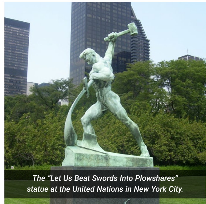
The “Let Us Beat Swords Into Plowshares” statue at the United Nations in New York City.

“Now it shall come to pass in the latter days that the mountain of the LORD’s house shall be established