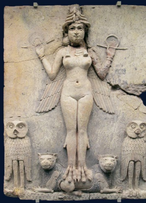
Ishtar the goddess of fertility, from whose name the word “Easter” comes.

God inspired the prophet Jeremiah to take Israel to task for their mixture of true religion and pagan practices.