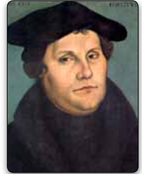
Martin Luther, who initiated the Protestant Reformation, admitted that “ the name ‘Trinity’ is nowhere to be found in the Holy Scriptures, but has been conceived and invented by man. ”

“Little direct response can be made to this charge. It is unlikely that any text of Scripture can be shown to teach the doctrine of the Trinity in a clear, direct, and unmistakable fashion ” (pp. 108-109). Later in this booklet we will consider various scriptures often used to support the Trinity doctrine.