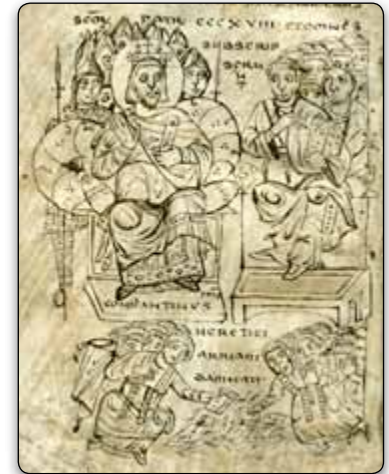
This 9th-century manuscript shows Constantine, enthroned at upper left, overseeing the burning of Arian books after the Council of Nicaea in A.D. 325.

Disagreements soon centered around another issue, the nature of the Holy Spirit. In that regard, the statement issued at the Council of Nicaea said simply, “We believe in the Holy Spirit.” This “seemed to have been added to Athanasius’s creed almost as an afterthought,” writes Karen Armstrong. “People were confused about the Holy Spirit. Was it simply a synonym for God or was it something more?” (p. 115).