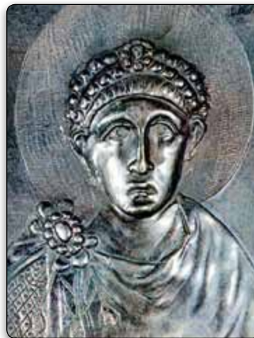
Theodosius I, depicted here in a silver plate commemorating the 10th anniversary of his reign as Roman emperor, enforced the decision of the Council of Constantinople establishing the Trinity as official doctrine. All other views of God were condemned as heretical and would not be tolerated.

The council adopted a statement that translates into English as, in part: “We believe in one God, the Father Almighty, Maker of heaven and earth, and of all things visible and invisible; and in one Lord Jesus Christ, the only-begotten Son of God, begotten of the Father before all ages . . . And we believe in the Holy