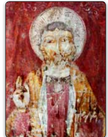
This 13th-century fresco in a church in Perugia, Italy, depicts the Trinity as a being with three faces representing Father, Son and Holy Spirit.