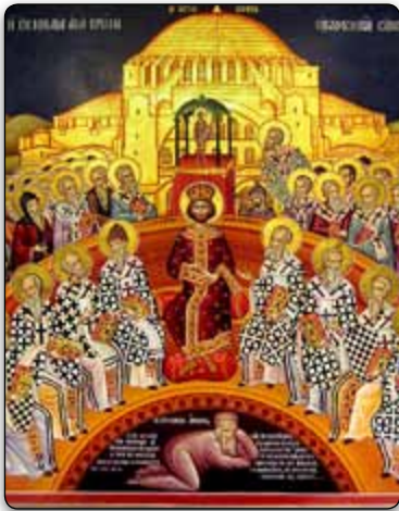
This scene from a monastery in Greece depicts Constantine, in the center, presiding over the Council of Nicaea, with the condemned Arius, whose views of God were rejected, humbled in defeat at the bottom.

The groundwork for official acceptance of the Trinity was now laid—but it took more than three centuries after Jesus Christ’s death and