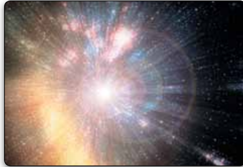
The Bible reveals that the divine Being who later became Jesus Christ was the One who “created all things” and interacted with human beings as the God of the Old Testament.

As is common in most English translations throughout the Old Testament, the word “LORD” here with capital letters is substituted for the Hebrew consonants Y-H-W-H (commonly known as the Tetragrammaton, meaning “four letters”). No one today knows for certain how to pronounce this