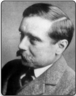
Historian and science fiction author H.G. Wells wrote, “ There is no evidence that the apostles of Jesus ever heard of the trinity—at any rate from him. ”