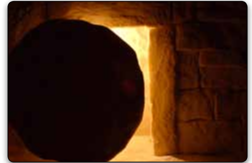
Scripture describes Jesus Christ existing as God with the Father before His human birth. The evening before His crucifixion, He prayed to be restored to the glory He had earlier shared with the Father—which came to pass after His resurrection.

Paul tells us that we should have the same humble, serving attitude of Jesus Christ, “who, although He existed in the form of God, did not regard equality with God a thing to be grasped [i.e., tightly held on to], but emptied Himself , taking the form of a bond-servant, and being made in the likeness