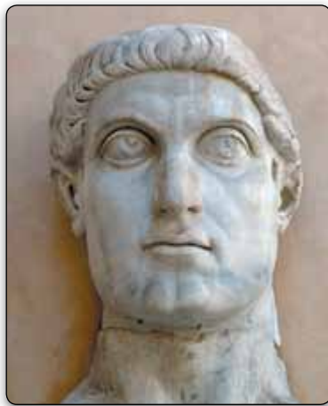
The Roman emperor Constantine the Great, while himself not really a Christian, convened and played a major role in the Council of Nicaea, which laid the groundwork for acceptance of the Trinity doctrine.

Let us be clear that when it comes to the intellectual and theological debates in those early centuries that led to the formulation of the Trinity,