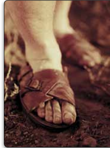
The apostle John makes the incredible statement that “the Word,” who was with God and was God, “became flesh and dwelt among us” as a physical human being.

This passage is all-encompassing. Jesus created “all things . . . that are in heaven”—the entire angelic kingdom, which includes an innumerable number of angels—and the indescribably vast universe, including planet earth. Many