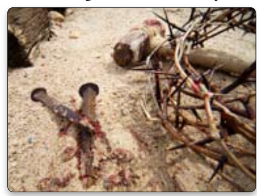
Crucifixion was an excruciatingly painful way to die, with victims sometimes suffering in agony for several days.

"After managing to exhale, the person would then be able to relax down and take another breath in. Again he'd have to push himself up to exhale, scraping his bloodied back against the coarse wood of the cross. This would go on and on until complete exhaustion would take over,