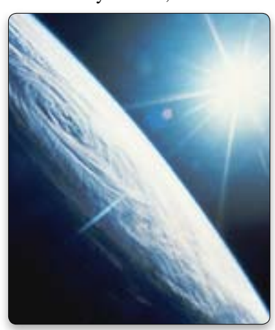
Jesus Christ will return to earth to save the human race from extinction, intervening when mankind is on the brink of self-annihilation.

Initially at least, it will not be a pretty sight. Revelation 6:16-17